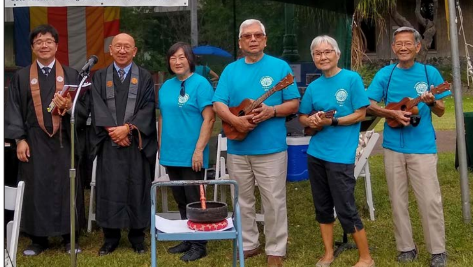
HI, HI, HI, BEAUTIFUL SUNDAY: The Dharma Hawaiians played gathas at the Hawaii Buddhist Council booth at the Hawaii Book & Music Festival at the Civic Center grounds on Sun., May 5, then finished off with a rousing chorus of "Beautiful Sunday."