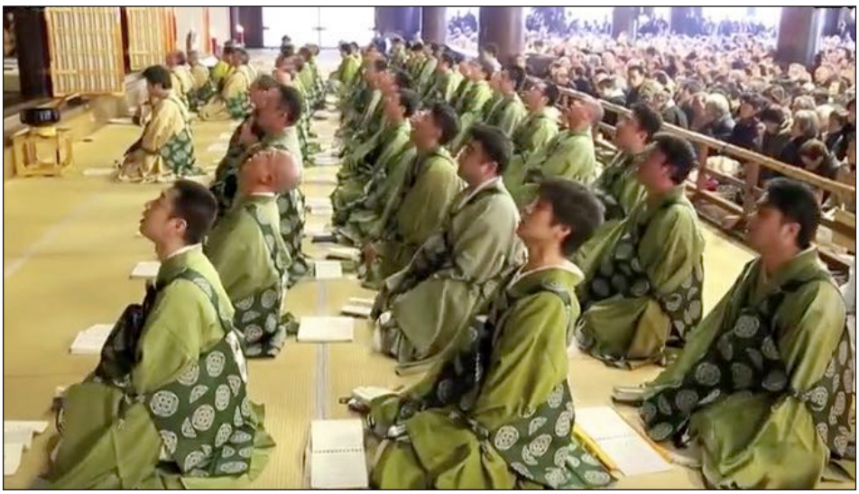
Chanting ministers sway back and forth and from side to side during the special Hoonko memorial service commemorating Shinran Shonin's death on Nov. 28 nearly 800 years ago. The style of chanting is said to echo the image of Shinran, who continued to offer fervent prayers on a rocking boat in rough waters when he was exiled to Echigo province.

We went to morning service at 6:30, followed by breakfast. The rest